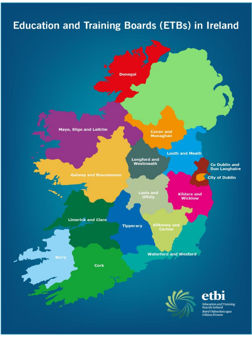
Figure 1: Education and Training Boards (ETBs) in Ireland

There are a total of sixteen ETBs throughout the country, as shown in Figure 1 below.