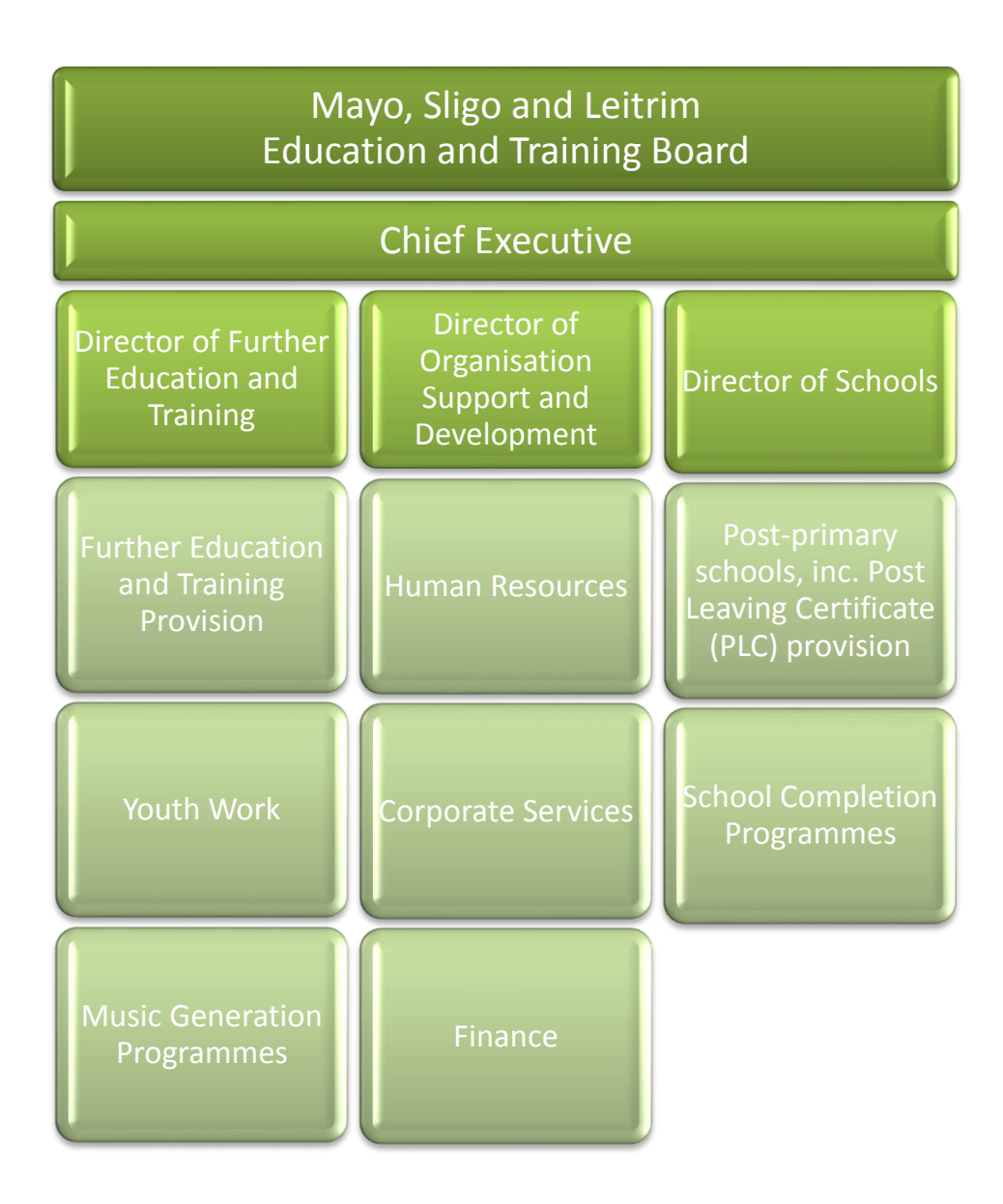
Figure 3: Organisational Structure of MSLETB

The Board of MSLETB is responsible and accountable for the proper direction and control of the organisation, as set out in the primary Act, other relevant legislation and the Code of Practice for the Governance of Education and Training Boards. The Chief Executive is the accounting officer for MSLETB and is supported by a Senior Management Team consisting of three appointed Directors. The organisational structure of MSLETB is shown in Figure 3 below.