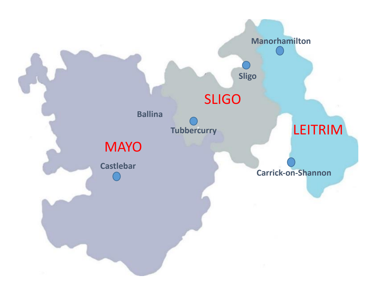
Figure 2: MSLETB operational area

MSLETB has the largest geographic area of all of the new ETBs, covering an overall area of 9,014 km². It stretches from the Drowes River near Bundoran to the Erris peninsula in the west, down to Killary harbour and across to the Shannon at Carrick-on-Shannon. MSLETB serves a population of 228,086 (CSO 2016) people and its head office is located in Castlebar, with offices in Sligo and Carrick-on-Shannon, as can be seen in Figure 2 below.